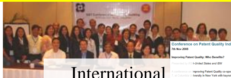
Conference on Patent Quality Indexing: Who Benefits? 7th Nov 2008